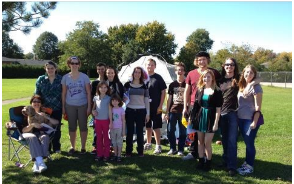
On Thanksgiving weekend, the Teens & Twenties had our second annual Turkey Trek. Another great event! Lots of fun!