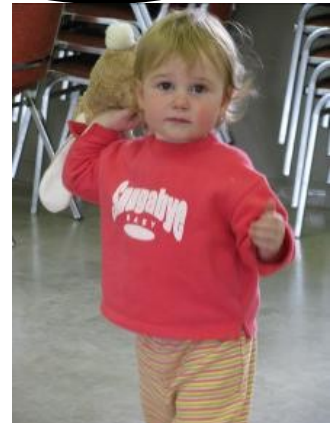
I just had a nap in a broom closet!