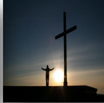
Midweek Online Worship