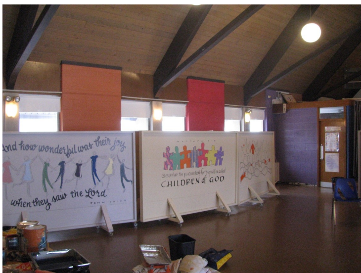
Right: A well-deserved coffee break.