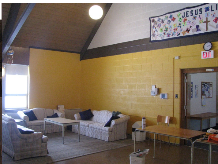
The final result.