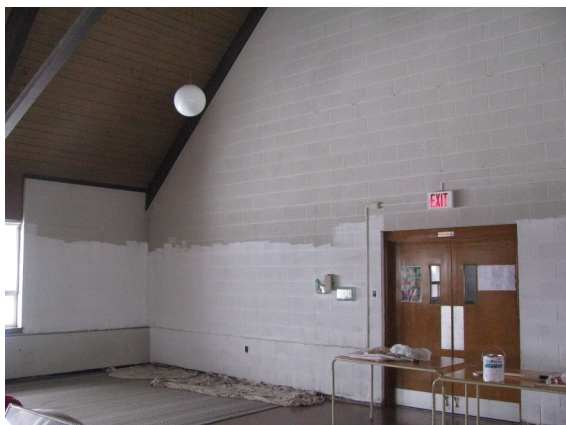
The John Marshall Hall with the beginning of the primer on.