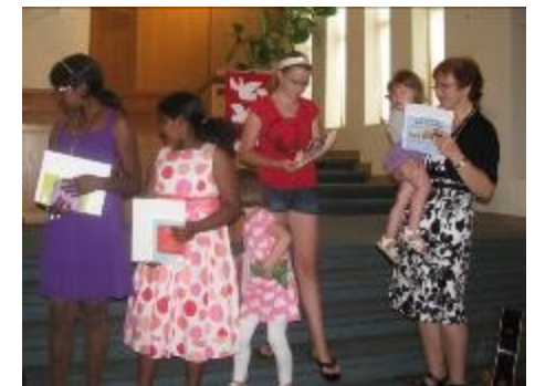
(Top: Faithful Attendance.