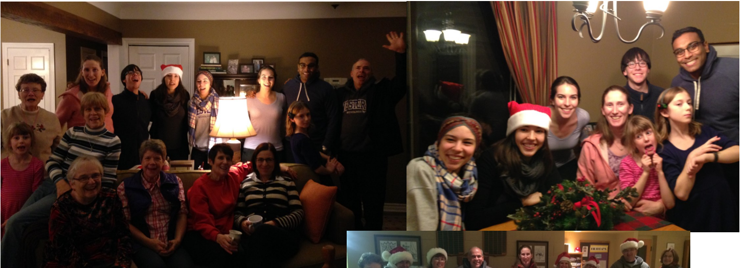
Christmas Caroling in December.

I often get in such a hurry to get the newsletter out, that I don't take the time to include photographs, even though I know that most people love to see them. So instead of an article this month, I'm going to include a few pages of photos that may not have appeared in newsletters over the past year. If they have, forgive me and enjoy them again. If you'd like to enjoy more photos, check out 2014 in Review on the Chalmers website: http://www.chalmerslondon.com/2014-in-review.html