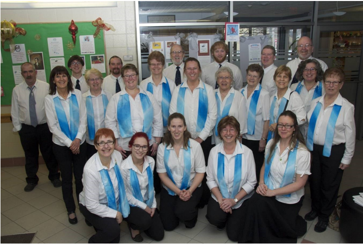
Left: Reachout singing at the Hamilton Road Seniors' Centre for their Christmas lunch.