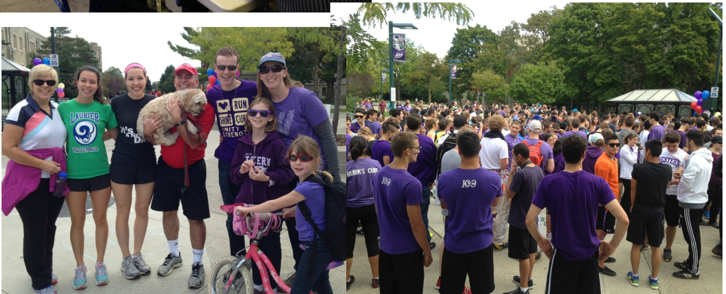
Below: A small group from Chalmers joined a mighty throng from Western for the Terry Fox Run (walk/bike).