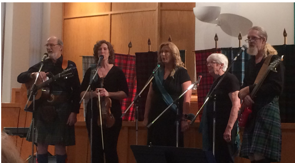
The Hunter family, known as The Gaels when on stage together, performed traditional Scottish folk music.