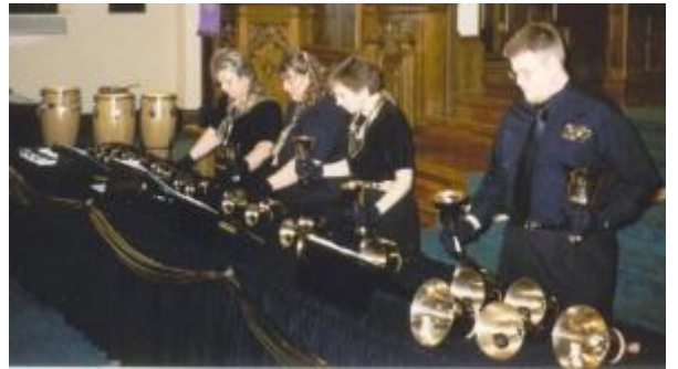
This photo was taken at First St. Andrew's United Church, home of the Bellissima Ringers.

about the size of an inch and some of them were the size of my foot. The bigger they were, the lower they played. And sometimes they played more than one in each hand, and one lady even strung some together. They were really, very super good!